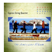
The American Album Barber, Dvořák, Griffes, Puts AV 2304