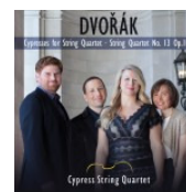
Dvořák Cypresses, Quartet No. 13 AV 2275