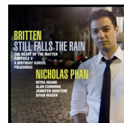
Britten: Still Falls the Rain (AV 2258)